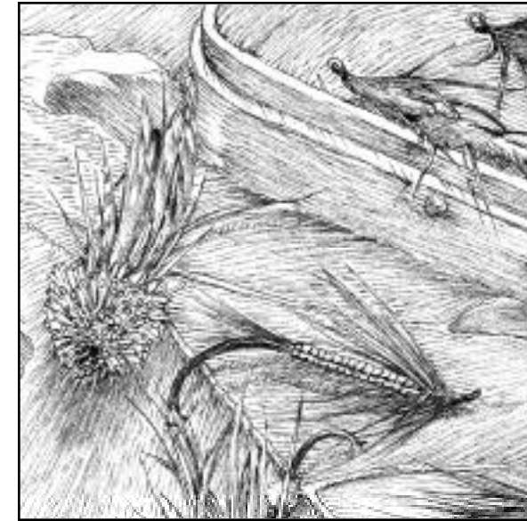
Art provided by Al Hassall. ©2004

Canada's premier hands-on fly fishing show